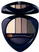
Eye & Brow Palette