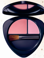
Blush Duo 02